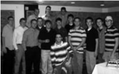
Active chapter members proudly celebrate their newly renovated home.

This past year has been a very challenging year for Kappa Chapter. The renovation of the chapter house was completed in time for the actives to move in for the start of the fall semester. A real feat considering the project started almost two months late and still met the deadline. A few items spilled over into September and even October.