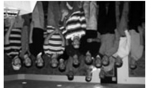
Kappa Chapter actives are enjoying their newly-renovated home!

Did You See the Newly Renovated House during our Grand Re-Opening Celebration? See Inside for Details!